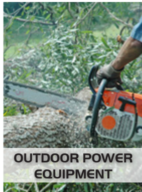
OUTDOOR POWER EQUIPMENT